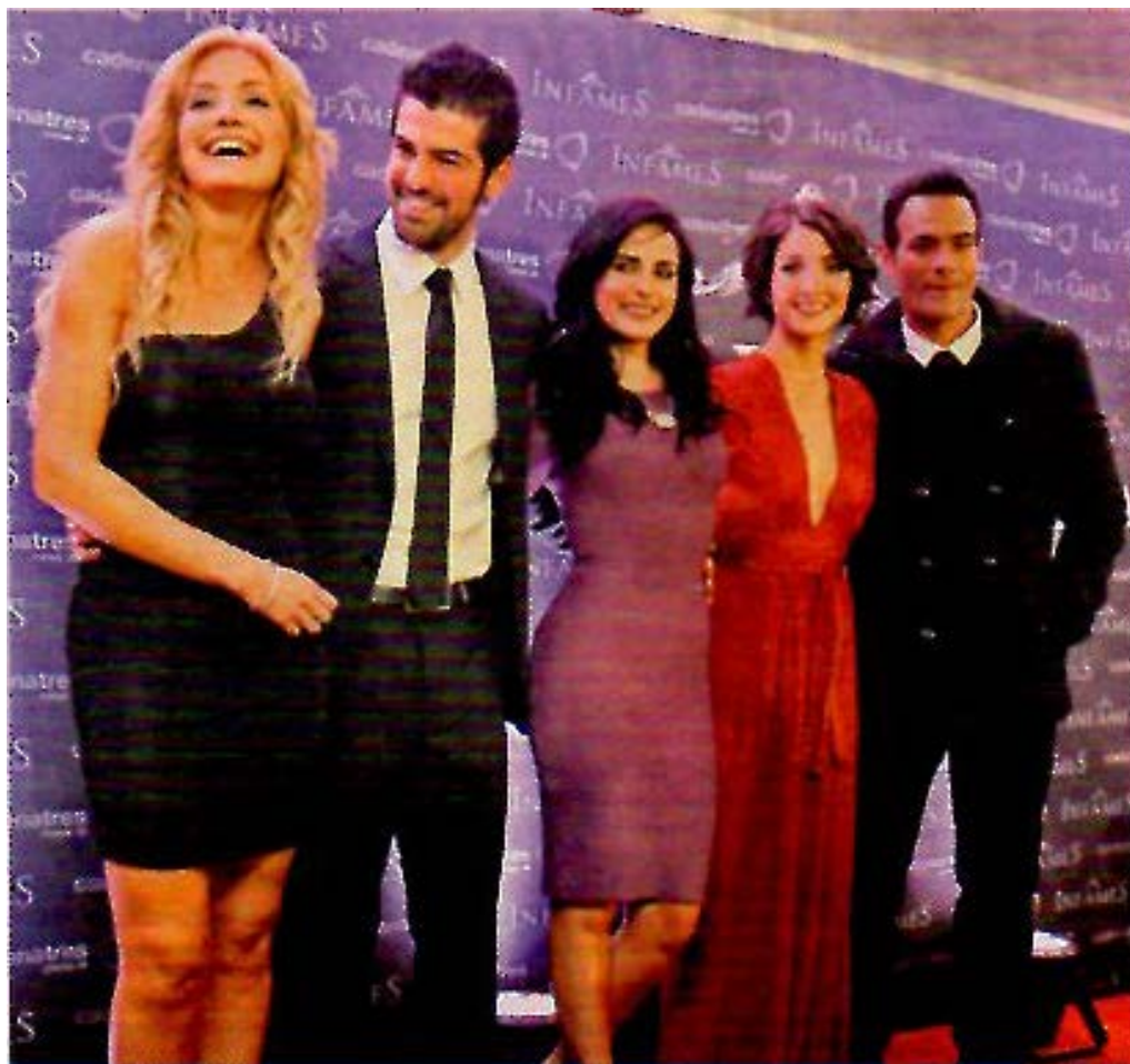
Actors Lisette Morelos, Miguel Muñoz, Ximena Herrera, Eréndira Ibarra and Luis Roberto Guzmán play the main parts in the story.

“I hope that this serves for analysis and to create greater citizen awareness,” stated the producer.